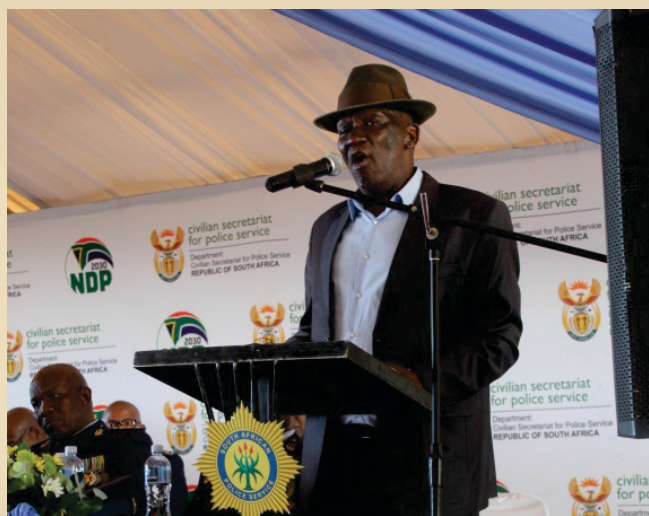
Minister of Police Mr Bheki Cele addressing Mt Fletcher Community members during the opening of Police Station.

has also donated horses to increase police visibility in this area. Do not lure our police into corrupt activities. I am aware of the murder rate, car high-jacking and stock theft that are prevalent in this area. I would like to take this opportunity to call upon all community members in this area, to become integral cogs of government in the fight against crime. We have now realized that government alone cannot win the fight against crime without the involvement of community members. It is high time that the community members should now occupy centre stage in the fight against crime so that the people could live in peace and harmony with one another," said Minister Bheki Cele.