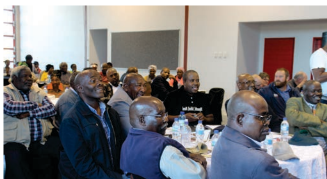
Famers Association and Business Community listening attentively during the engagement session held in Elliot.