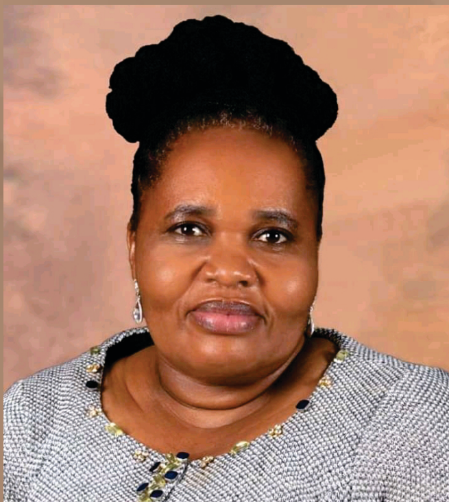
The MEC for Safety and Liaison Weziwe Tikana

“The department has shown its critical importance in ensuring community safety as well as political stability in the Province of the Eastern Cape through its role in support of the economic drive of agro-economy by addressing the challenge of stock theft, and service delivery protests. SAPS visibility played a very strategic role during this time with minimum loss of life during these protests. The cry for service delivery by our people compels us towards an integrated approach on serving the people of this province. The SAPS should not be the face of government under these circumstances. Both provincial and local government spheres must show unity and strength towards addressing the calls for help by our citizenry,” said MEC Tikana.