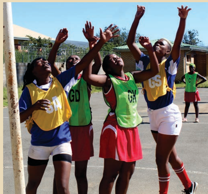
Netball Payers showcasing their talent during Sport Against Crime at Cala Sport Grounds.

In reinforcing what the MEC had said, Mayor Buyiswa Ntsere of Sakhisizwe Local Municipality said: “The young people are the future leaders, and we want parenting to take a good posture in this area. We want young people to learn to discern right from the wrong so that crime free communities could be built. We want you to refrain from embarking on criminal activities; instead you should use sporting activities as powerful weapons with which to fight crime.”