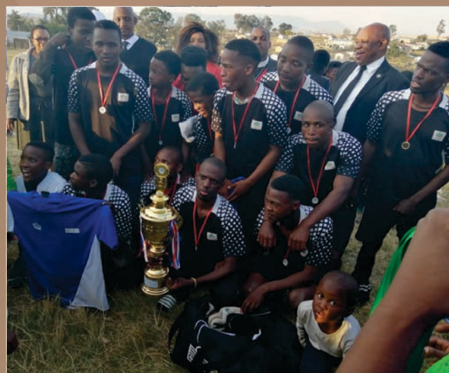
The winners who received a kit and a trophy during Sports Against Crime on 30 June 2019 .