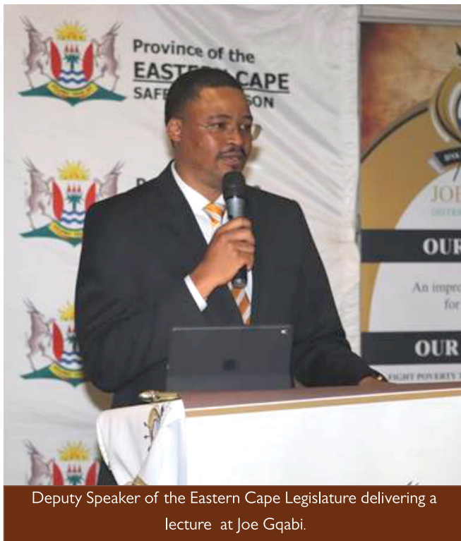
Deputy Speaker of the Eastern Cape Legislature delivering a lecture at Joe Gqabi.

The Department of Safety and Liaison through the Joe Gqabi District Office held a memorial lecture and Sports against crime in Aliwal North on the 28 of June 2019. The aim of the programme was to combat crime, educate youth in order for future generations to distance themselves from drugs, criminal activities and excessive use of alcohol. The programme was held in partnership with Joe Gqabi Municipality, South African Police Service and Junior Commissioners.