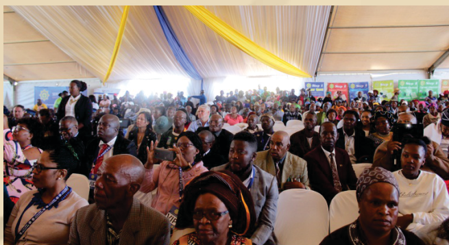
The Community of Mount Fletcher listen attentively during the official opening of the Police Station.

"Do not set alight this Police Station because you will never get another one. This is your Police Station, safeguard it and let it be a community owned Police Station. The 15 police officers and the Station Commander are here to serve the community due to the clarion call of "Thuma Mina" concept of the President Cyril Ramaphosa of South Africa. We issued them with new vehicles as tools of trade, 4X 4 vehicles will be brought here as well to suit the terrain of this area. A victim centre has been set aside to cater for the needs of women and children. The Farmers Association in the area