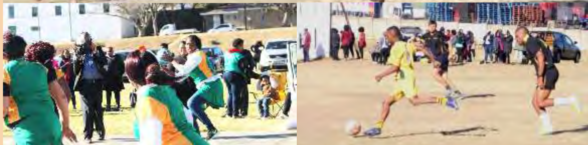
Staff of the Department of Safety and Liaison playing sport during the Youth and Wellness day held in King William's Town recently.