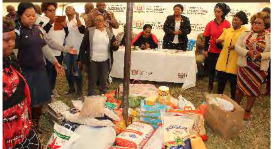
Government officials and community based organizations presenting groceries to the bereaved family

teenager had been arrested and had appeared in the Butterworth Magistrate Court for a bail hearing, but he was not granted bail. Consoling the family members, MEC vowed that the perpetrator responsible for the murder of their daughter would face the wrath of the law.