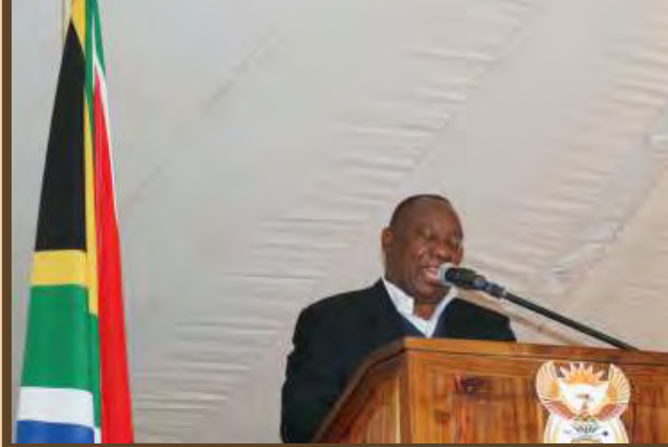
Deputy President, Honourable Cyril Ramaphosa addressing members of the Whittlesea community during his recent visit to the Eastern Cape

Nomaxabiso White Door Support Centre in Whittlesea, in the Chris Hani District, was one of the projects, which, were visited by the Deputy President of the Republic of South Africa, Honourable Cyril Ramaphosa during his recent visit to the Eastern Cape.