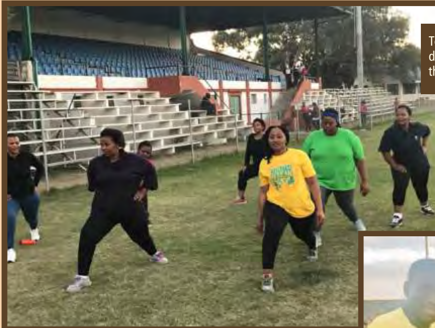
Team Fitness doing what they do best!