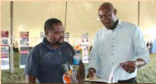
Acting HOD interacting with a community member during the Freedom Day celebrations held in Nkantolo, Bizana on 27 April 2017.