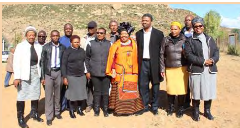
Iinkokheli ezisuka kwiminyango eyahlokeneyo kumaSebe kaRhulumente kwisithili saseJoe Gqabi