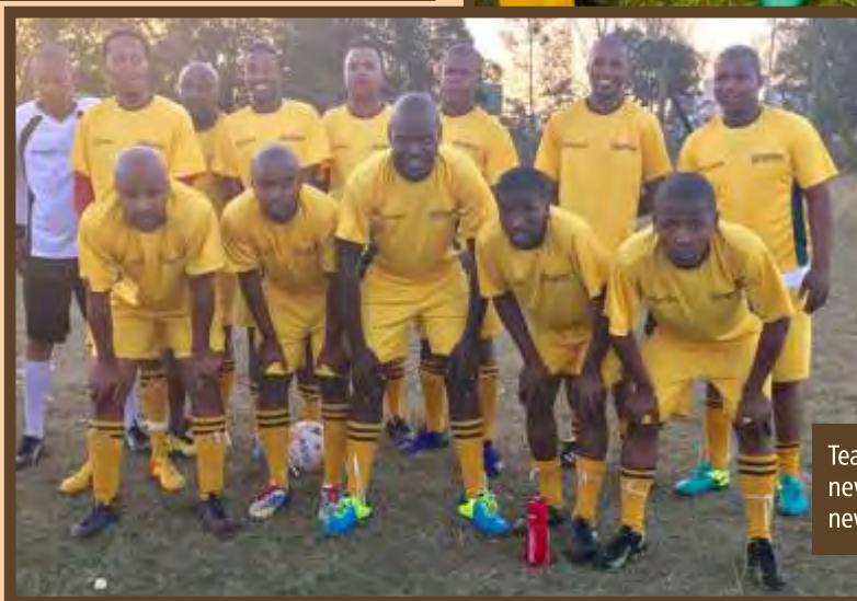
Team Safety with their new signings for the new season.