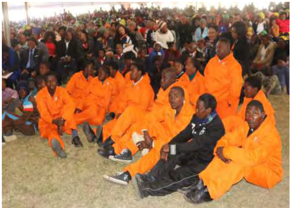
EPWP beneficiaries from Whittlesea