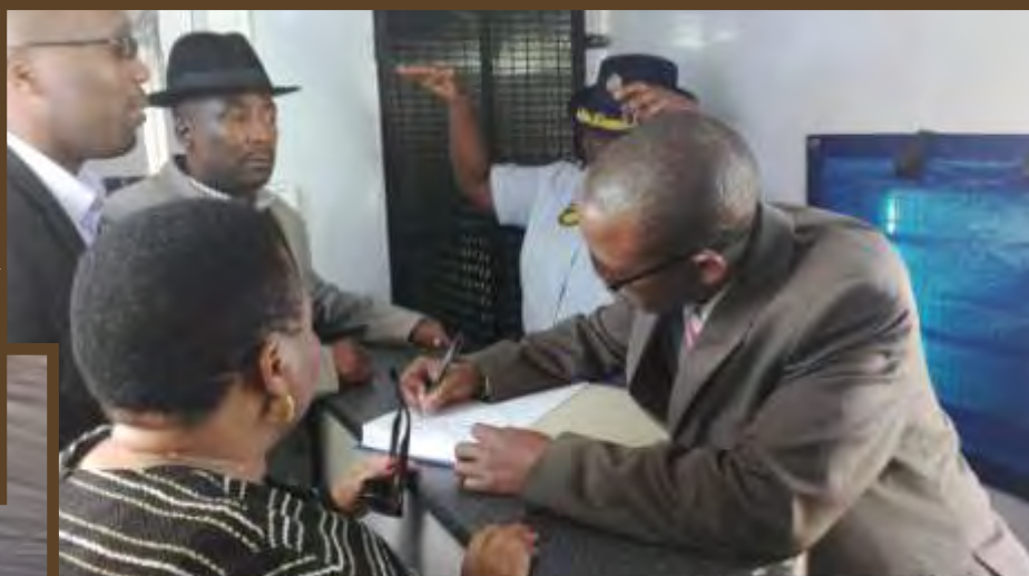
Deputy Minister of Police, Honourable Bongani Mkongi signing the visitors register at Fort Beaufort Police Station

Among the challenges that the DM went there to address, was the closing of the police station in Fort Beaufort by the Department of Labour. DM Mkongi confirmed that the police station was in its final stages of renovations.