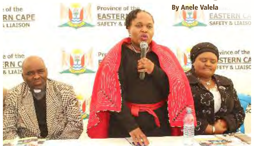
Honourable MEC Weziwe Tikana speaking to the bereaved family

A man linked to the brutal killing of the