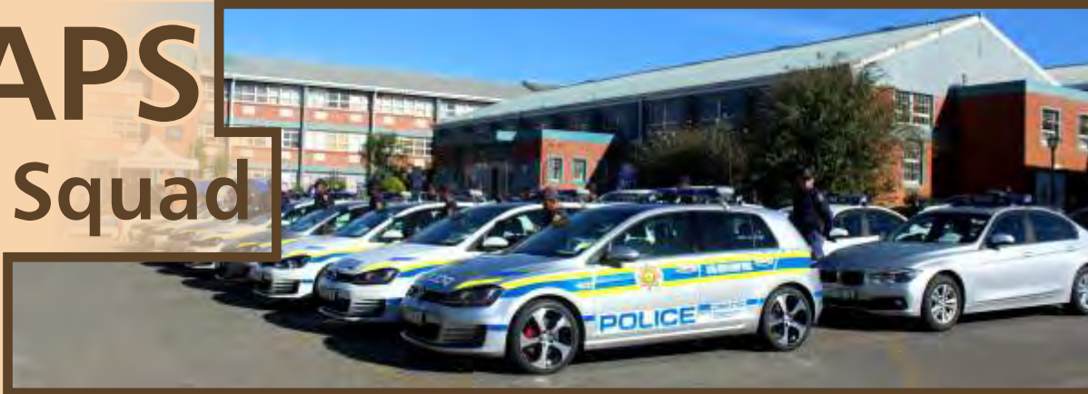
Police officers with the 27 high performance vehicles that were recently handed over to the SAPS flying squad by Honourable MEC Tikana

The MEC for Safety and Liaison Honourable Weziwe Tikana, together with Eastern Cape Provincial Commissioner Lieutenant General Liziwe Ntshinga handed over 27 new Police vehicles to Cluster Commanders at the Zwelitsha Provincial Head Office recently.