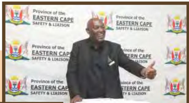
Acting HOD of the Department of Safety and Liaison laying the foundation during the Induction of the Youth Development Forum held at the King Club in King William's Town recently.

partnership with the Department of Safety and Liaison to collaborate with it during recruitment processes of interns and WILs. She also advised the youth, especially the ladies, to put education first. She gave them a seven worded statement that: "Books before boys because boys bring babies".