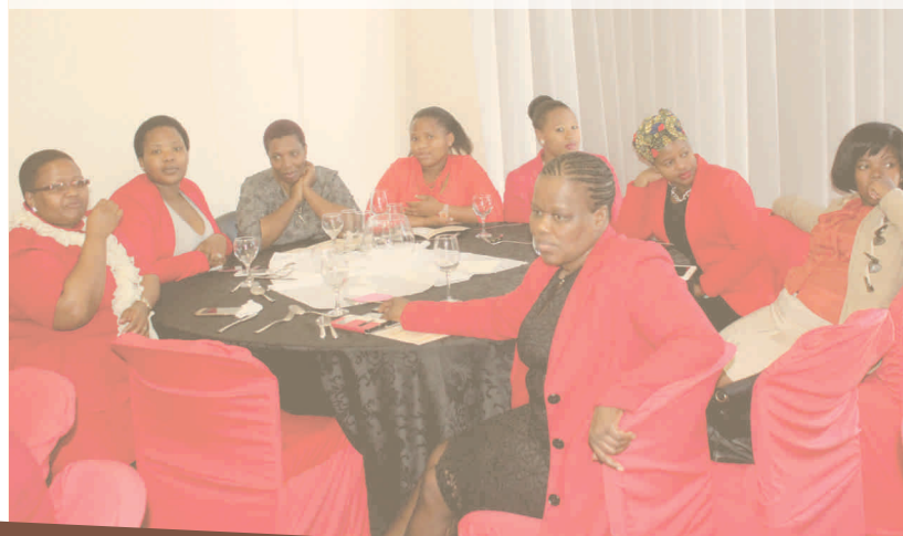
Ladies dressed in red in line with the theme of the 2017 Women Empowerment Workshop of the DSL