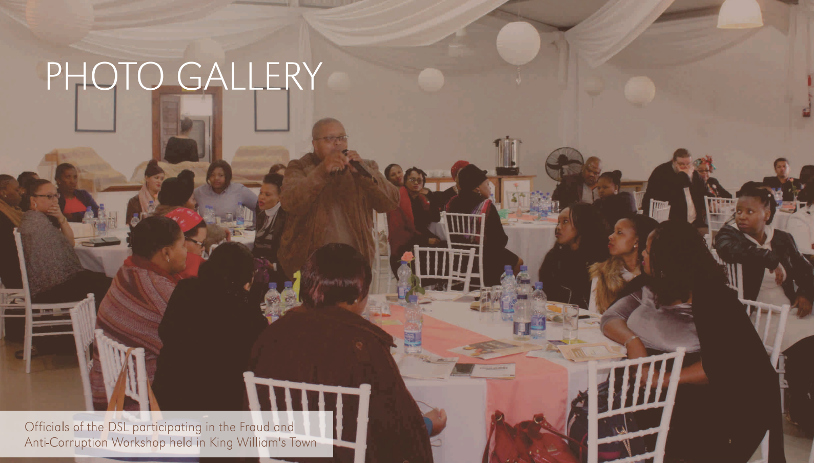
Officials of the DSL participating in the Fraud and Anti-Corruption Workshop held in King William's Town