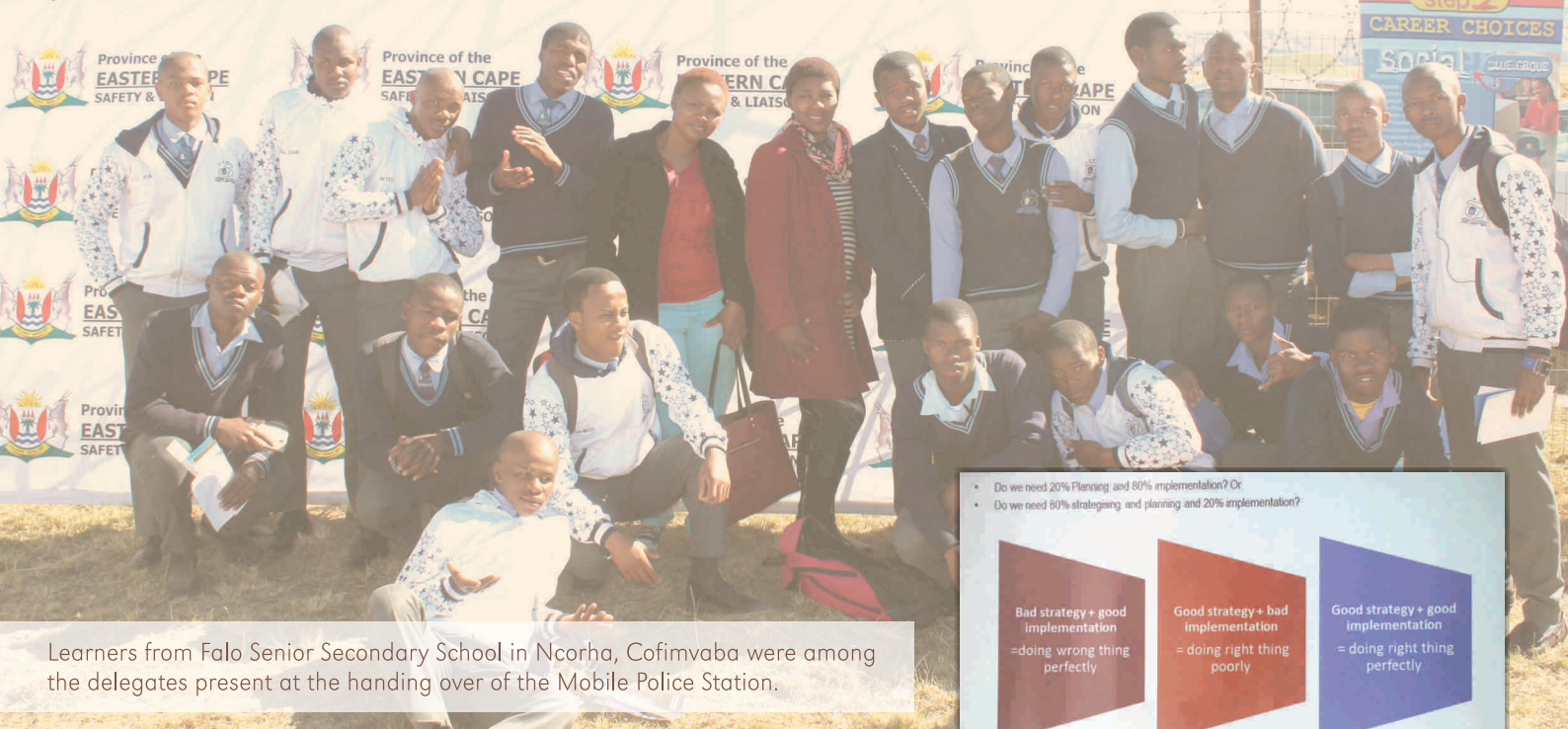
Learners from Falo Senior Secondary School in Ncorha, Cofimvaba were among the delegates present at the handing over of the Mobile Police Station.