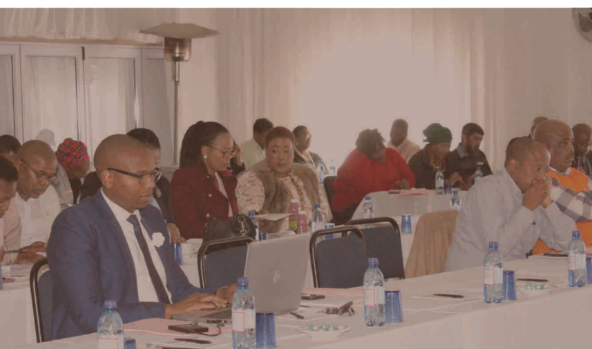
STRAT PLAN: DSL officials met in East London at the Strategic Planning conference on the 6 July, 2017.