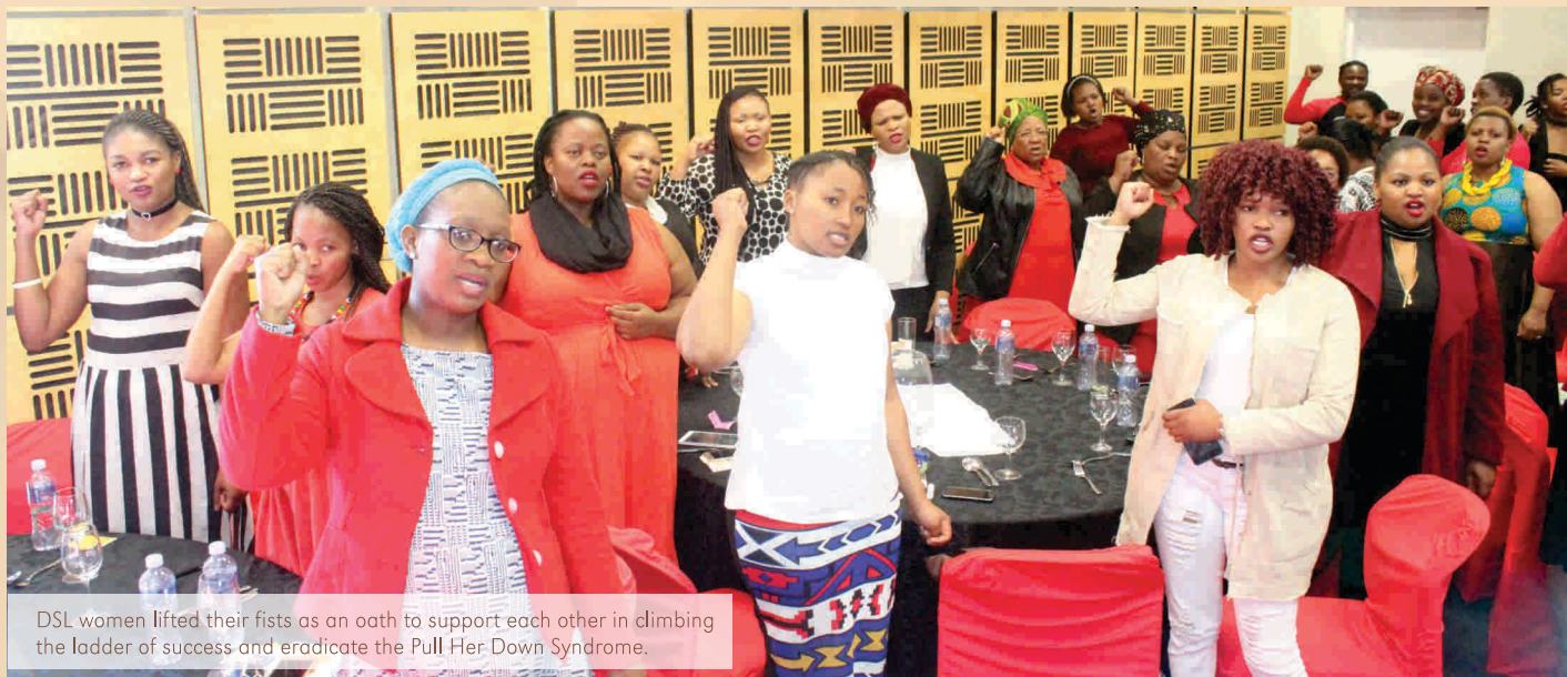
DSL women lifted their fists as an oath to support each other in climbing the ladder of success and eradicate the Pull Her Down Syndrome.

A highly packed program of the Head of Department's Women's Day whose purpose of the event was to empower women within the department, was held at the Steve Biko Centre at Ginsberg, in King William's Town on Thursday, 31 August 2017.