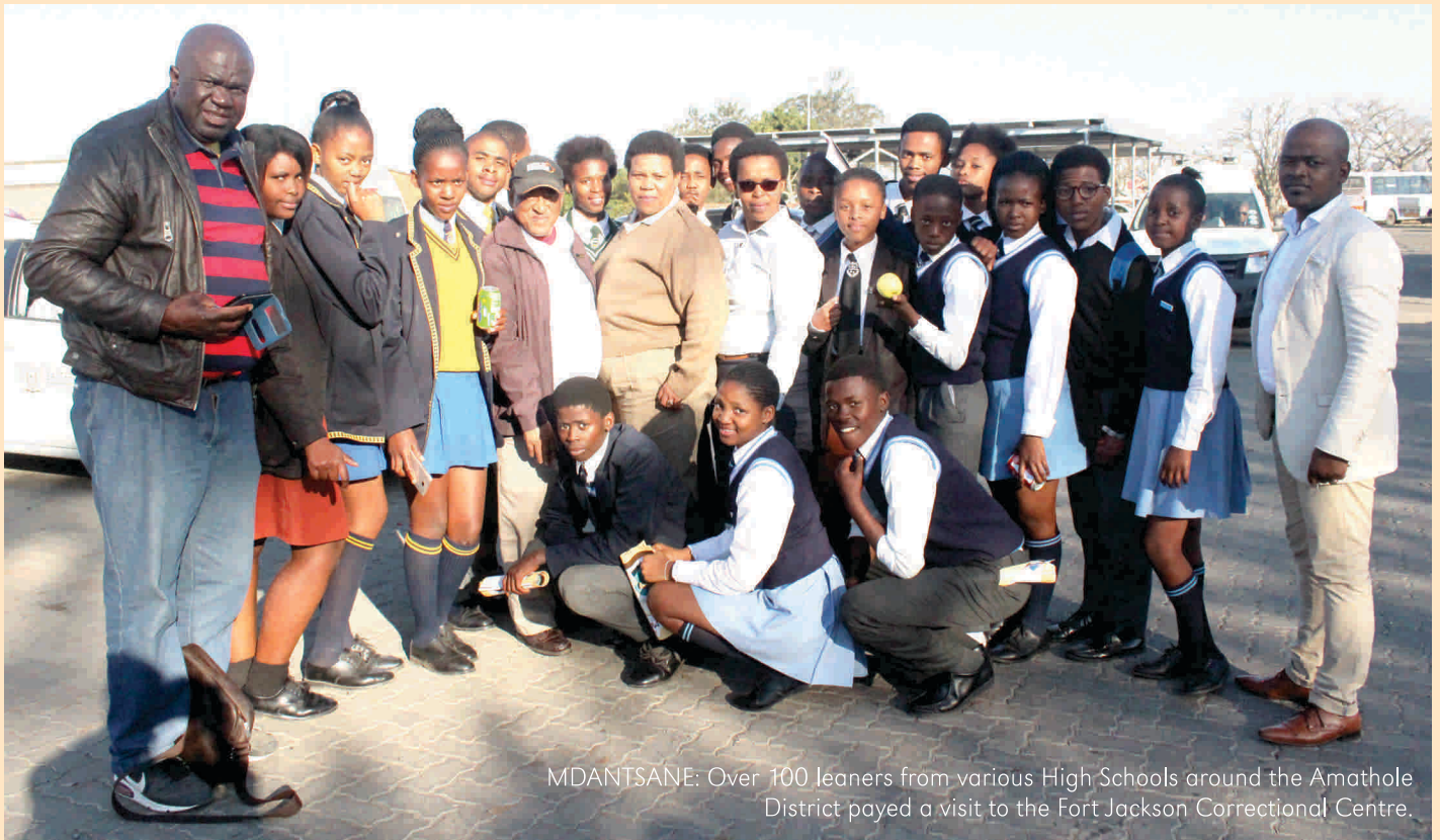
MDANTSANE: Over 100 learners from various High Schools around the Amathole District paid a visit to the Fort Jackson Correctional Centre.

On Wednesday, 2 August 2017, the Department of Safety and Liaison (DSL) organized a prison tour at Fort Jackson Correctional Centre in Mdantsane.