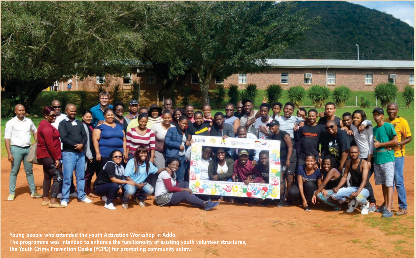
Young people who attended the youth Activation Workshop in Addo. The programme was intended to enhance the functionality of existing youth volunteer structures, the Youth Crime Prevention Desks (YCPD) for promoting community safety.

As a way of activating the youth and their capacities to be agents of safer communities, the South African Police Service (SAPS), the Department of Safety and Liaison (DSL) and the Inclusive Violence and Crime Prevention Programme (VCP) of the Deutsche Gesellschaft für Internationale Zusammenarbeit (GIZ) have developed a programme to enhance the functionality of existing youth volunteer structures, the Youth Crime Prevention Desks (YCPD) for promoting community safety.