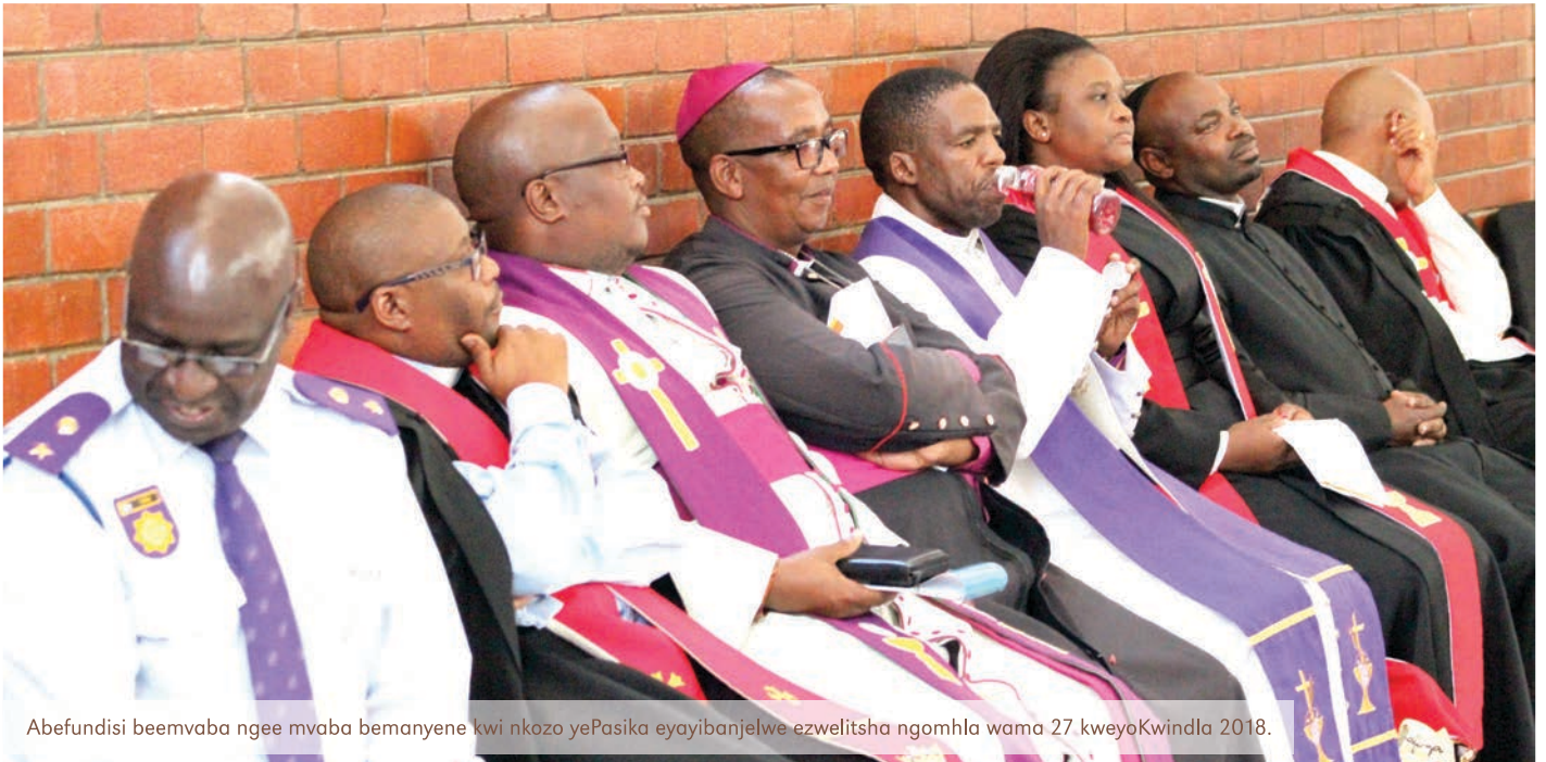
Abefundisi beemvaba ngee mvaba bemanyene kwi nkozi yePasika eyayibanjelwe ezwelitsha ngomhla wama 27 kweyoKwindla 2018.

Ngomhla wamashumi amabini anesixhenxe kwinyanga yoKwindla ngonyaka wamawaka amabini eneshumi elinesibhozo, uMphathiswa weZothutho, uKhuseleko noNxibelelwano uWeziwe Tikana wayesingathe inkonzo yomthandazo weholide zePasika.