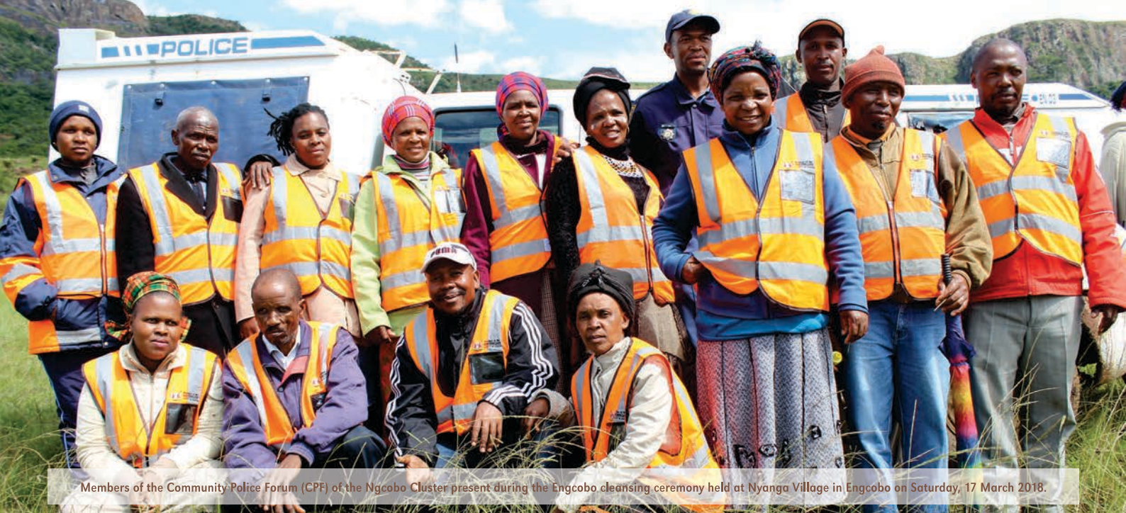
Members of the Community Police Forum (CPF) of the Ngcobo Cluster present during the Engcobo cleansing ceremony held at Nyanga Village in Engcobo on Saturday, 17 March 2018.