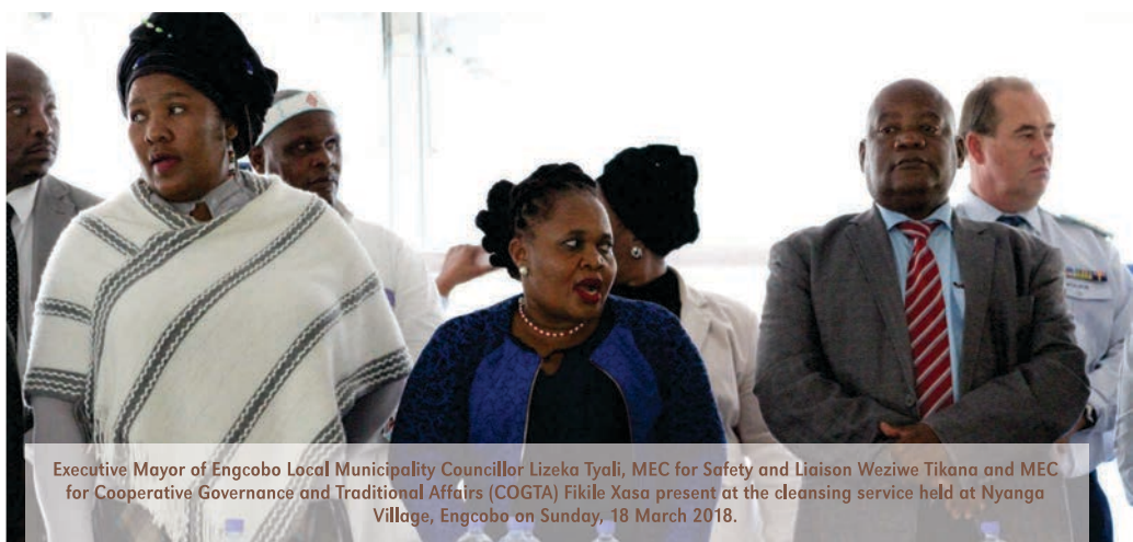
Executive Mayor of Engcobo Local Municipality Councillor Lizeka Tyali, MEC for Safety and Liaison Weziwe Tikana and MEC for Cooperative Governance and Traditional Affairs (COGTA) Fikile Xasa present at the cleansing service held at Nyanga Village, Engcobo on Sunday, 18 March 2018.