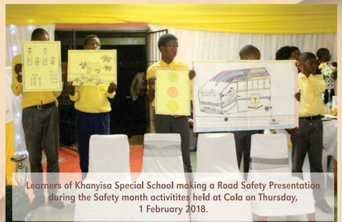
Learners of Khanyisa Special School making a Road Safety Presentation during the Safety month activities held at Cala on Thursday, 1 February 2018.

He also thanked the DSL for the sanitary towels it brought for the learners at the school.