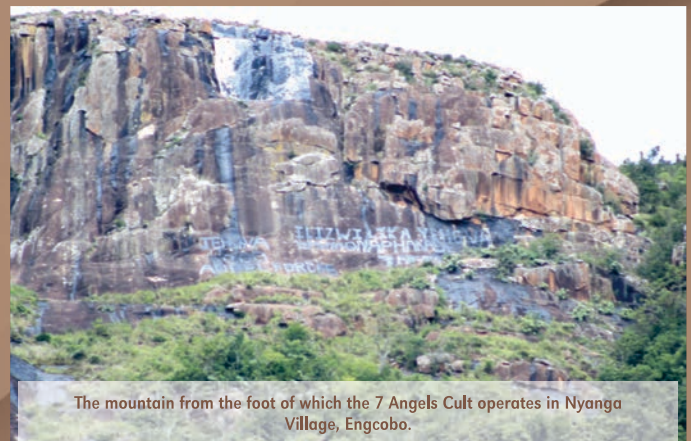
The mountain from the foot of which the 7 Angels Cult operates in Nyanga Village, Engcobo.

Nevertheless, good churches should continue to bring out the best in their people, so that each person could live in peace and harmony with the other. In this regard, churches are expected to play their vital role in restoring and upholding the moral fibre of the communities for the safety and security of all people in the Eastern Cape Province. Most importantly, as neighbours, we should know one another very well so that if there is anything that is likely to ruin the moral fibre of the community, it can be detected at an early stage. This will then afford the community members an opportune time to overcome it just before it grows to a disaster, which, is akin to that of Engcobo.